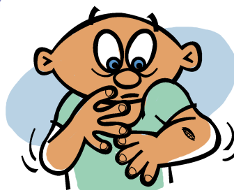
SLOW HEALING WOUNDS

HIGH BLOOD GLUCOSE MAY LEAD TO A MEDICAL EMERGENCY IF NOT TREATED.